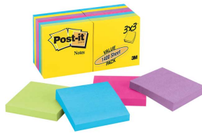
3x3 Sticky notes